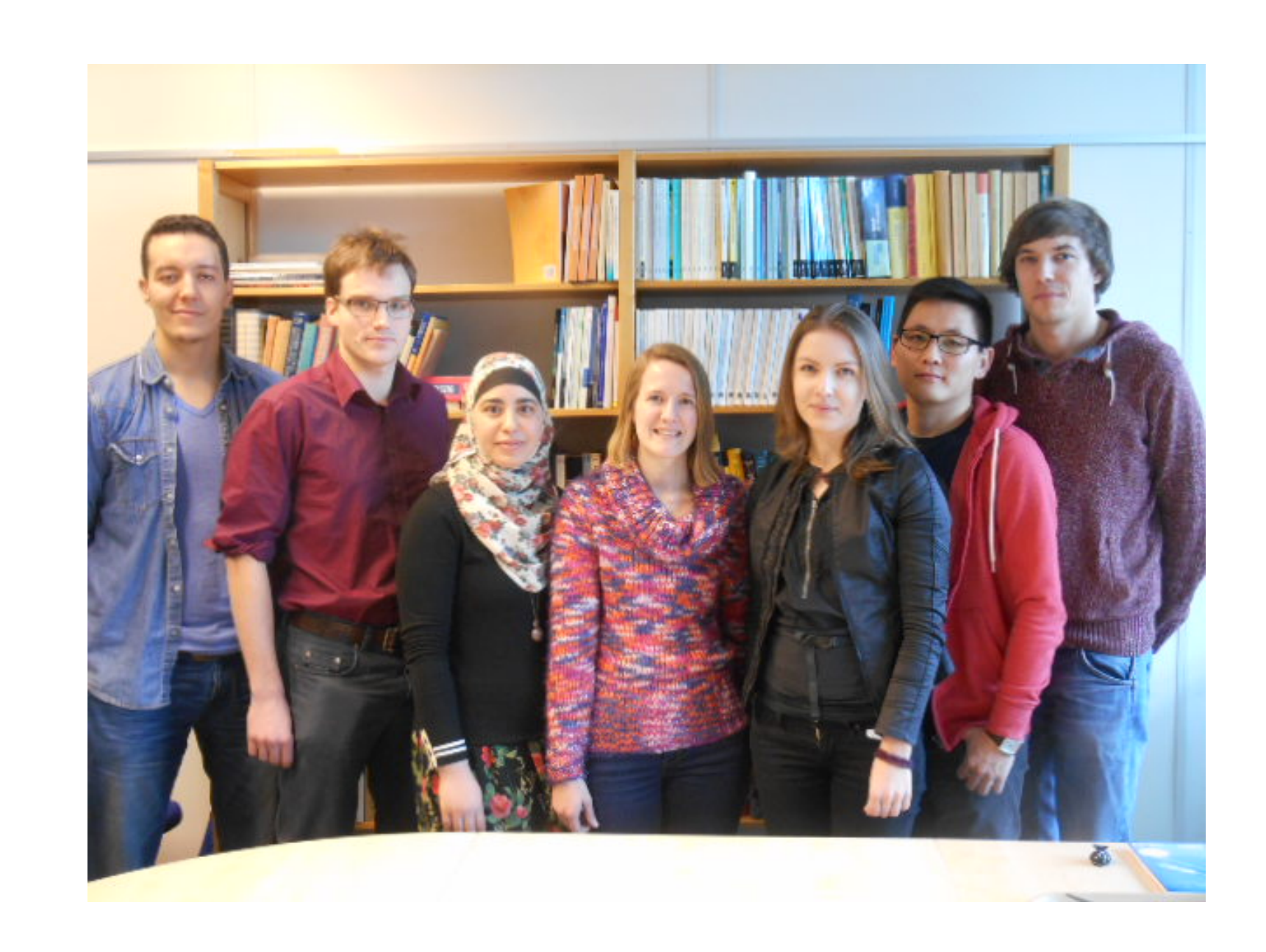
The chapter is open for MSc and PhD students as well as for staff members.

The Chapter at TU Delft has been founded in 2014. The current board: